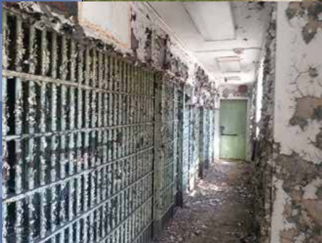
Washington County Jail Facility