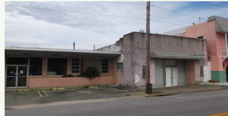
Domestic Laundry, Panama City